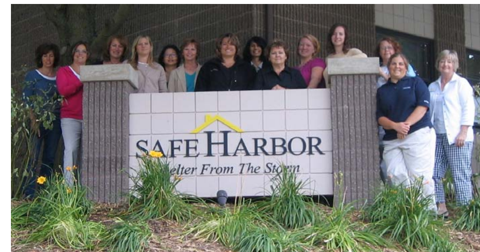
This is a photo of the volunteer group Women 4 Families from Kohler Company (Engineering) who adopted Safe Harbor as their project last summer—raised money, got donations and worked hundreds of hours to transform our shelter inside and out!

Safe Harbor is dedicated to the prevention of all forms of domestic abuse and sexual assault in the community through raising awareness, education, and providing safety, shelter and support for all victims.